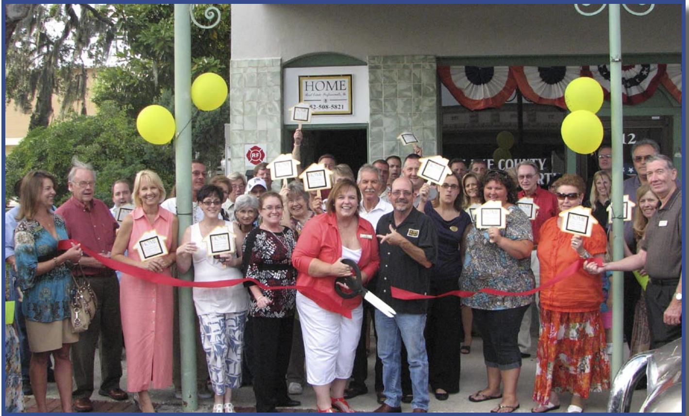
Home Real Estate Professionals Ribbon Cutting and Business After Hours May 5, 2011

Presorted-STD U.S. Postage PAID Mid-Florida, FL Permit# 57120