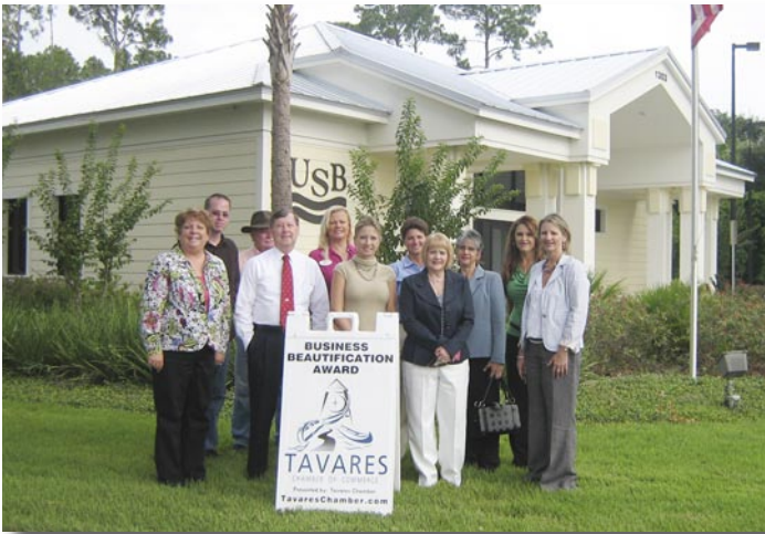
United Southern Bank in Tavares earned the 3rd Quarter Business Beautification Award