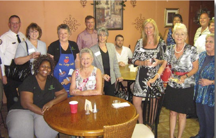
Simply Desserts Shoppe Business After Hours June 8, 2011