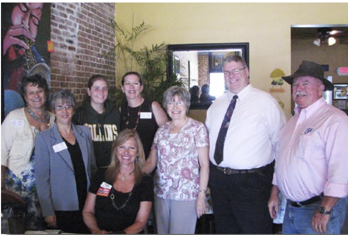
Tavares Chamber May Networking Lunch at Ruby Street Grille on May 10, 2011