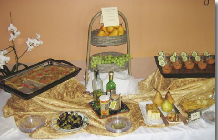
Simply Desserts Shoppe Business After Hours June 8, 2011